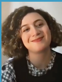
Rose Matafeo Actress, Comedian, TV presenter