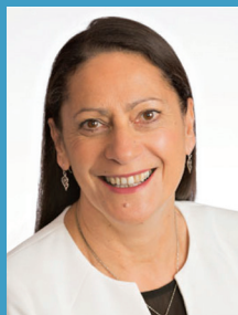
The Honourable Poto Williams Politician