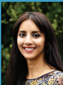
Golriz Ghahraman Politician