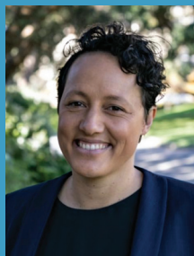
The Honourable Kiri Allan Politician